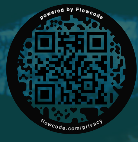
WEEK 6: God's Just Servant