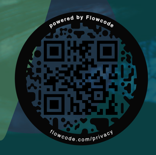
WEEK 5: Leading Justly