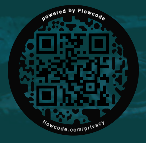
WEEK 2: A Prayer for Justice