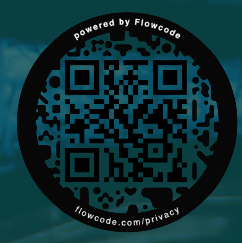
WEEK 7: Resurrection Hope